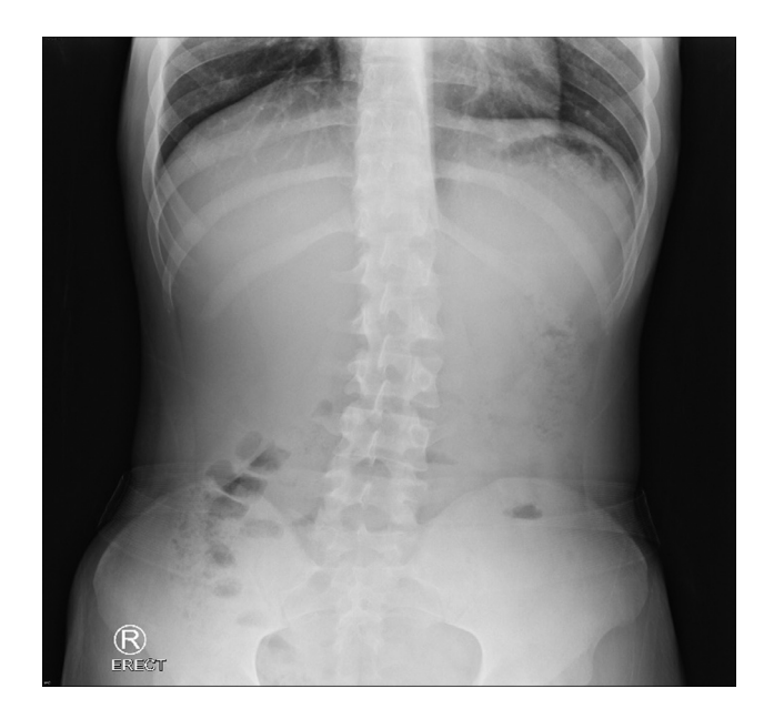
Fig. 1 – An abdominal radiograph showing paucity of normal bowel gas pattern and ill-defined soft tissue opacity occupying quadrants.

epidemiological location of the patient. In patients having no primary pulmonary focus, a delay can occur in the diagnosis of abdominal tuberculosis. The chest radiographs may be normal in 50%-60% of the patients with abdominal TB.